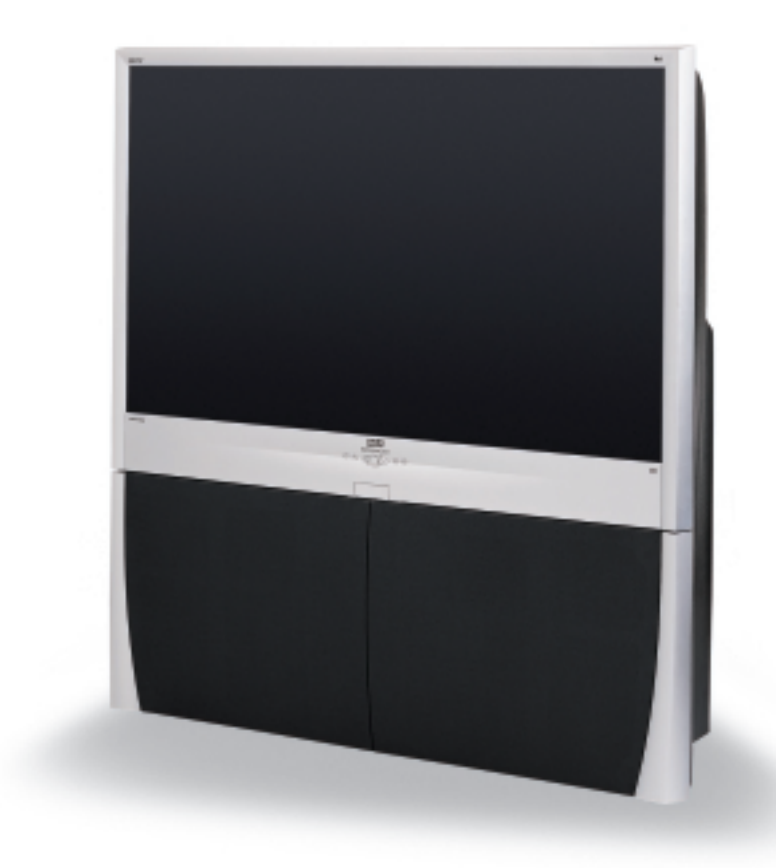
What is High-Definition Television (HDTV)?

For nearly 60 years, analog television has been the broadcast standard. This standard is now being replaced by digital television, which uses a continuous stream of computer-like numbers to transmit pictures, sound, and information.